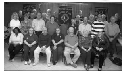
Waynesburg Lions Club

Presentation of the 2011 Distinguished Service Awards