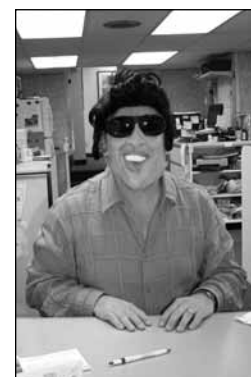
Can you guess who this is? You might need him when your sick.